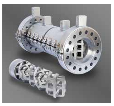
Fig. 1. Compact mixing: Promix Static Mixer SMB Plus

Although static mixers thermally homogenize the melt, they do not specifically adjust the melt temperature. Conse-